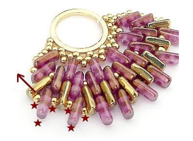
21) Repeat steps 18 and 19