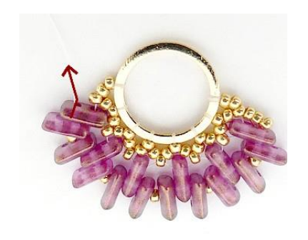
11) Here is the result 😊