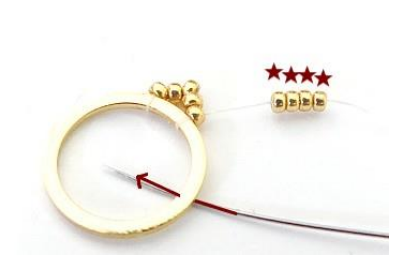
4) Pick up 4 SB15. Pass your thread under the circle. Repeat steps 3 and 4 by seven times