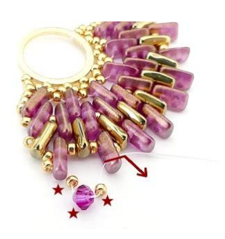
24) Pick up 1 SB15, 1 B3, 1 SB15 through the next Piros