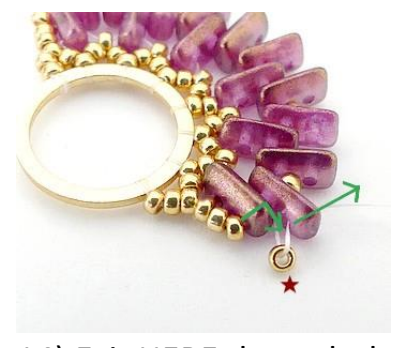
14) Exit HERE through the Piros. Pick up 1 SB15 and exit through the next Piros HERE (green arrow)