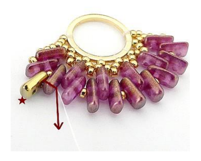
15) Pick up 1 Piros (C2) between each Piros