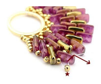
23) Pick up 1 SB15 through the Piros HERE