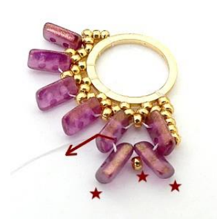
10) Pick up 1 Piros, 1 SB15, 1 Piros and exit through the next Piros. All the way around ©