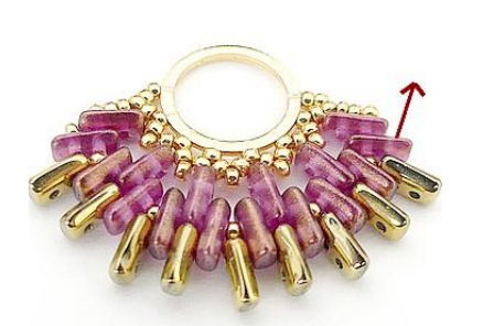
16) Here is the result 😊