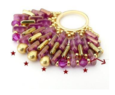
27) Repeat 2 times step 26, then steps 24 and 25