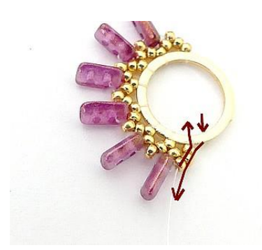
8) Pass through the three SB15. Pass your thread under the circle and exit through the three SB15