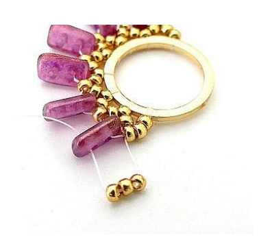
9) Pick up 3 SB15 in the second hole of the Piros