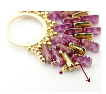
22) Pick up 1 SB15 (red star) and pass through the same Piros. Exit through the SB15