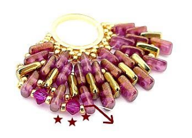
25) Repeat step 24