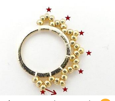
5) Here is the result 😊 Exit from the central SB15