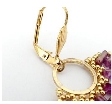
29) Pick up the earwire through the circle