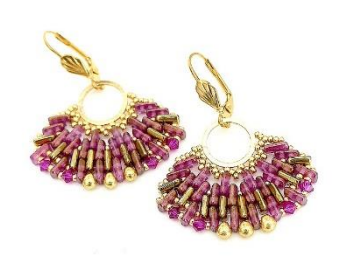
30) Make the second earring 😊