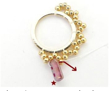
6) Pick up 1 Piros (C1) between each central SB15