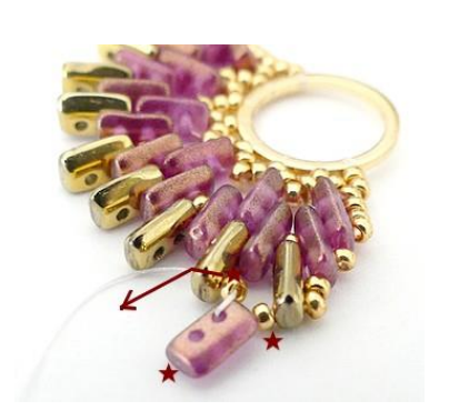
18) Pick up 1 SB15, 1 Piros (C1), 1 SB15 through the next Piros