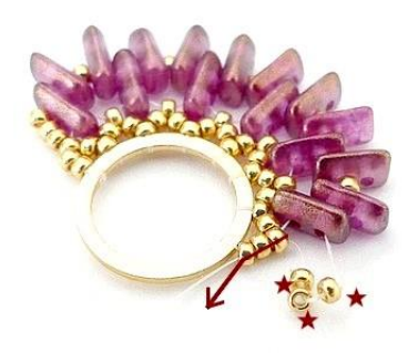
12) Pick up 3 SB15 through the three Piros HERE