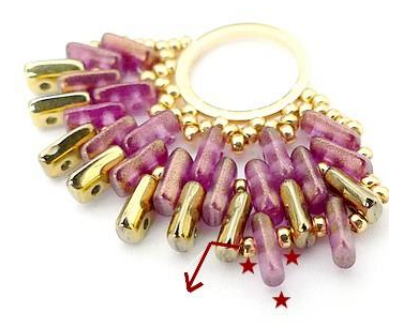
19) Repeat step 18