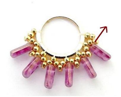
7) Here is the result 😊