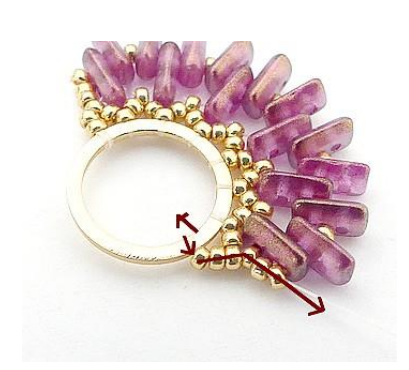
13) Repeat step 8 😊