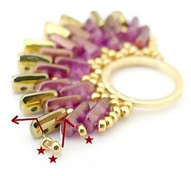
17) Pick up 1 SB15 and pass through the same Piros. Pick up 2 SB15 and exit through the Piros (C2)