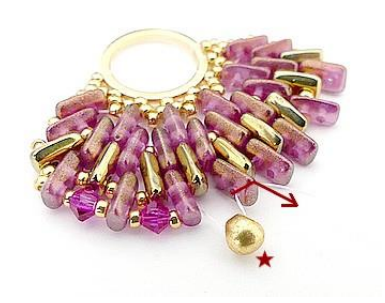
26) Pick up 1 Drop bead or 1 SB8 in the next Piros