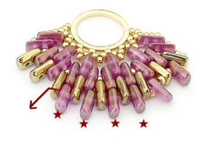
20) Pick up 4 Piros between the Piros